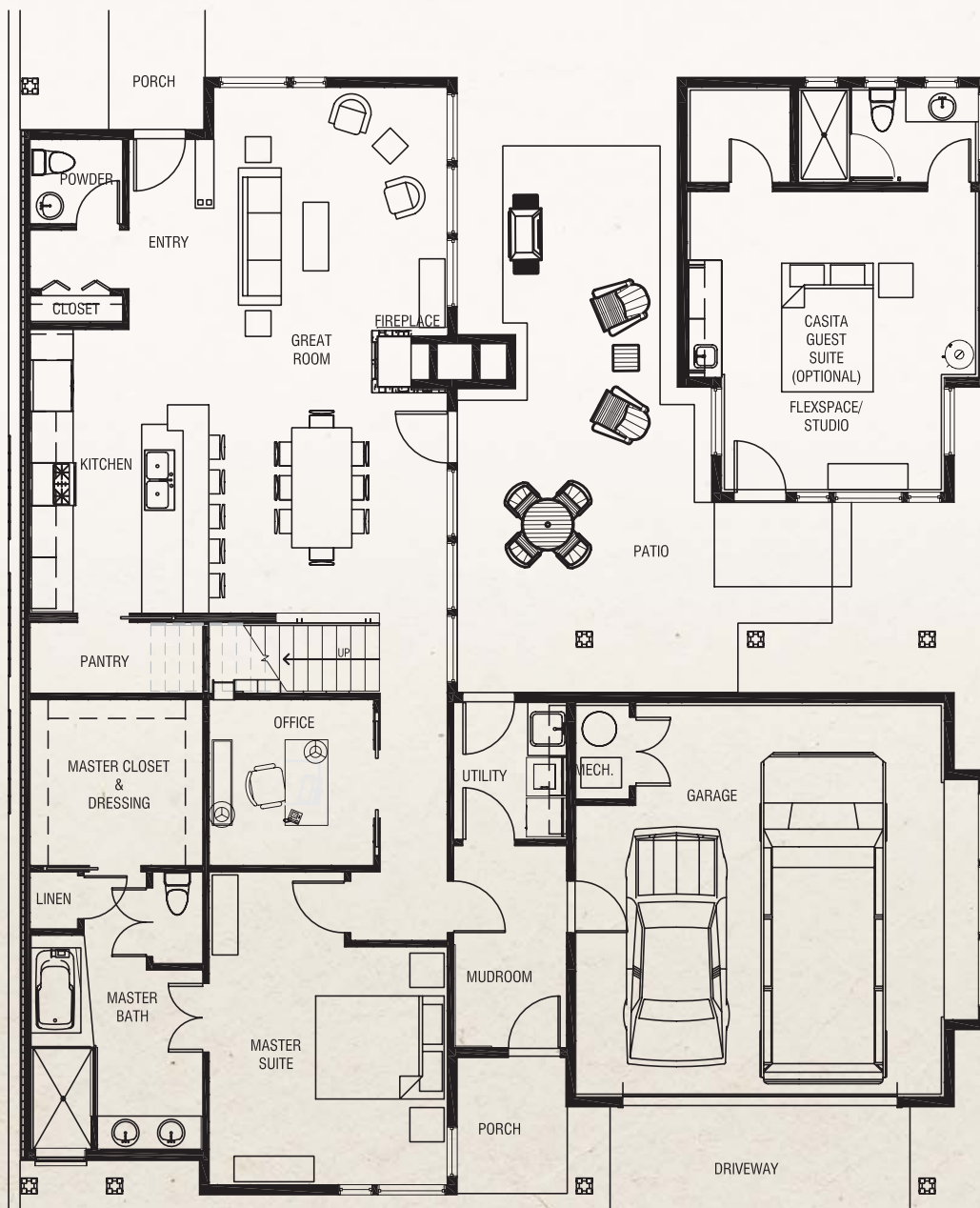
Main Level Floor Plan (See other side for Upper Floor Plan)